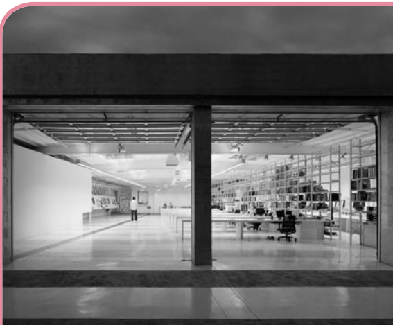
THE KENNETH T. AND EILEEN L. NORRIS FOUNDATION