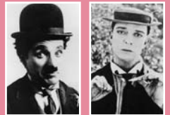
Charlie Chaplin Buster Keaton