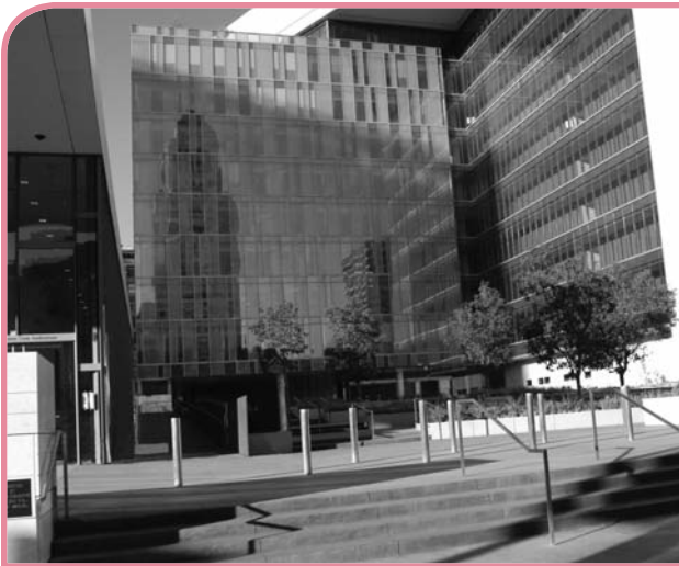
THE KENNETH T. AND EILEEN L. NORRIS FOUNDATION